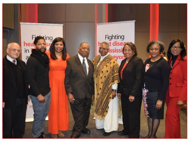
The JHS CEC held its second annual "Translating a History of African American Heart Disease into a Legacy of Health" event at the Mississippi Civil Rights Museum on February 15.